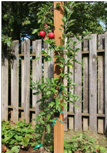
Figure 9. A backyard apple tree grafted on M9 rootstock is trained to grow against a post.

Regardless of the rootstock chosen, overall tree size is best maintained by proper training and pruning. Proper pruning also makes trees easier to spray and harvest, improves structural strength and lateral branching, increases fruit productivity and fruit quality (Stebbins 2007). Even standard-sized trees, which normally grow to 30 to 40 feet tall on seedling rootstocks, can be maintained at a height of 12 to 15 feet through annual pruning and training (tying down) of upright limbs.