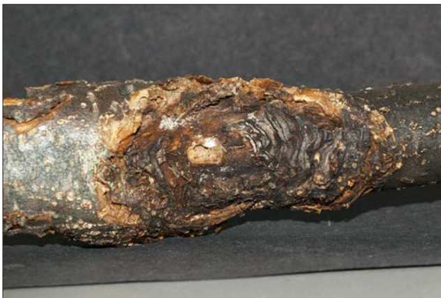
Figure 1. The symptoms of European canker ( Nectria galligena ) on apple include swollen, ring-shaped cracks forming along the bark of the trunk and twigs.

Biotic plant problems are caused by living organisms like insects and plant diseases, while abiotic plant problems are the result of non-living factors. Biotic plant problems may resemble abiotic problems in appearance; if a similar problem occurs among multiple