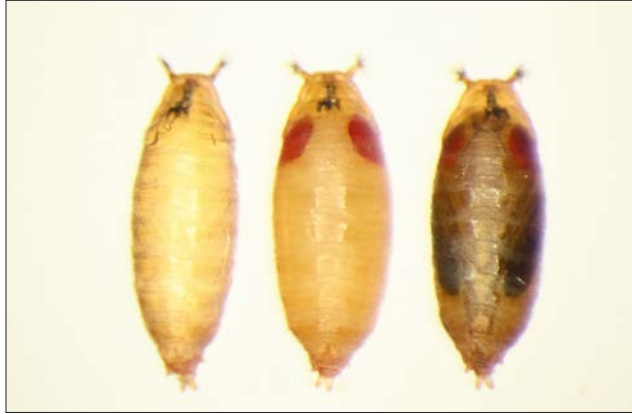
Figure 60. Spotted wing drosophila pupae.

should be destroyed to prevent the fly from completing its lifecycle.