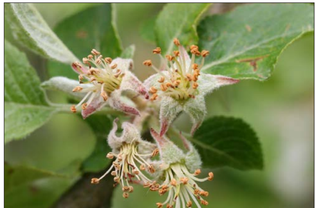
Figure 28. Petal fall stage in an apple tree.

Coryneum blight is spread by wet, rainy weather throughout the winter and spring. The most characteristic symptom of this fungal disease is small (less than 1/4 in. diameter) rounded leaf lesions with