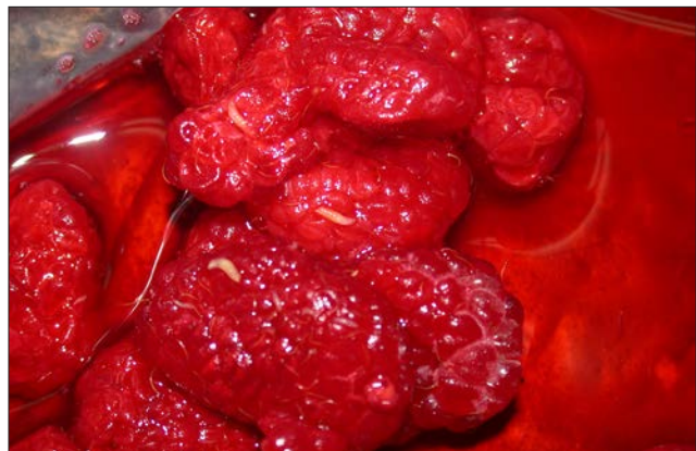
Figure 59. Damage from spotted wing drosophila larvae inside a ripe red raspberry fruit.

Biology and life cycle. In berry crops, a single female fly can lay several hundred eggs over her lifetime (20 to 30 days). In western Washington, the population of vinegar flies builds over the season. Strawberries and early season red raspberries may escape infestation, however the later ripening blackberries and blueberries are most susceptible as the vinegar fly population increases in mid-July. The larvae will feed extensively within the fruit, causing intact fruit to wrinkle, bruise, and collapse (Figure 59). Larvae feed inside the fruit for up to a week before they pupate. The brownish-white pupae stage (Figure 60) lasts for 5 days before they mature into adults. Infested berries cannot be salvaged and