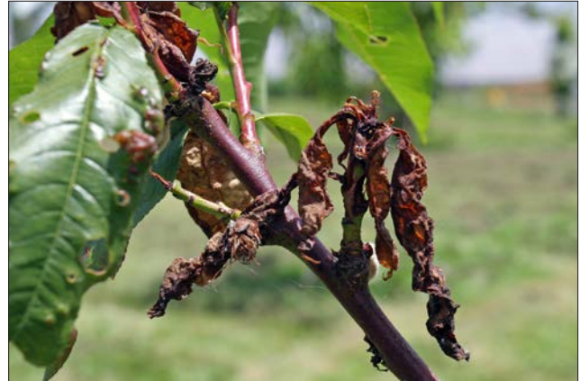
Figure 22. Symptoms of brown rot ( Monilinia fructicola ) on a cherry branch.

leads to an infection that causes blossoms to wither and die (Figure 22). Infected shoots and branches develop sunken cankers with gumming at the margins. As these cankers girdle the twigs, the tree gradually develops a very sparse canopy. Infected fruit will become covered in a gray-brown fungus effectively spoiling them (Figure 23).