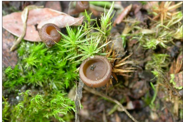
Figure 54. Mummyberry spore cups emerge in the late winter.

surface beneath the infected plants closely as the spore cups will only be 1/8 in. in diameter. Each spore cup will release spores that are spread by wind, rain, and pollinating insects, and will infect developing vegetative and floral tissues of nearby blueberry plants.