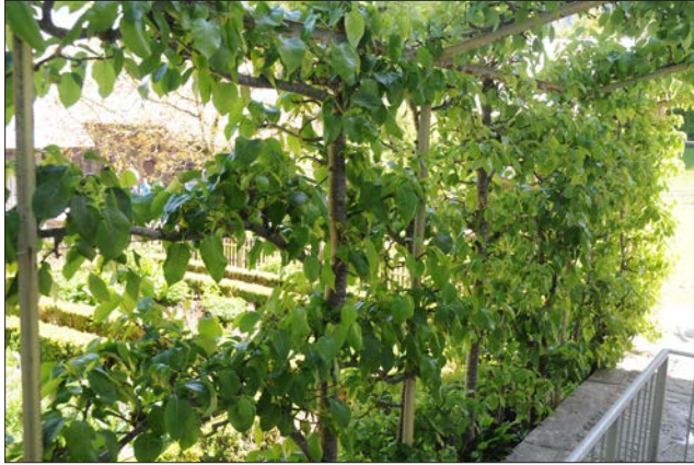
Figure 11. Backyard pear trees, which have been trained in an espalier design, create a low-growing "wall" of fruit.

and pears, prunes and plums can be trained to an espalier design.