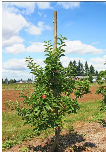
Figure 10. A mature apple tree on a full dwarfing rootstock is trained to a slender spindle design. Note the conical shape of the tree (wider at the base) allows sun exposure throughout the limbs.

The art of training fruit trees to a trellis is called espalier (Figure 11). Garden centers now stock young trees that have already been trained, which makes it considerably easier for the home gardener to set them on a 2- or 3-wire trellis. In addition to apples