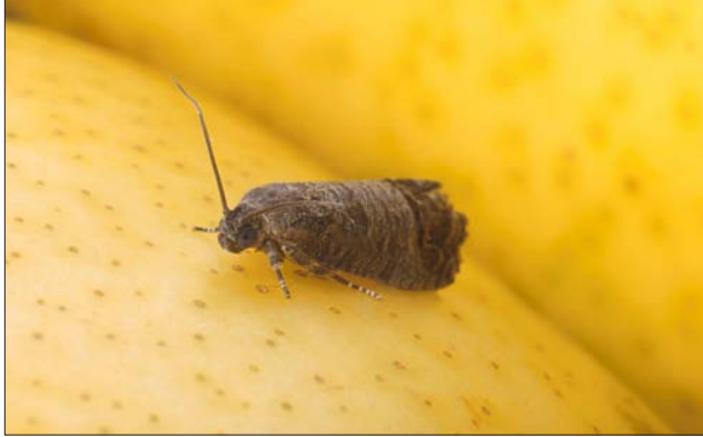
Figure 27. An adult codling moth on an apple.

search of a pupation site. There can be 2 to 3 generations, or flights, of adult codling moth per year.