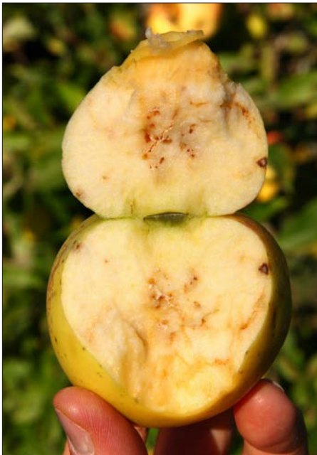
Figure 18. Feeding trails and spoilage caused by the apple maggot.

for the presence of clear wings with black bands, a pronounced white spot on the back of the thorax, and a black abdomen with light cross-bands (Figure 19). In late June and July, adult flies emerge from the ground beneath the host trees and may migrate to nearby home fruit trees, feral trees or commercial orchards. These flies continue to emerge well into the summer and early fall. The highest period of fly activity usually peaks in August. Within 7 to 10 days after emergence, female flies begin to lay elliptical-shaped eggs (1/16 in.) under the skin of fruit by puncturing the surface of the fruit with their ovipositors. Larvae are cream colored, legless maggots that will grow to no more than 3/8 in. in length. When mature, the apple maggot will drop from the fruit to the ground, burrow into the soil, and