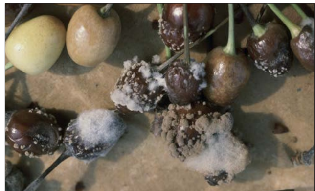
Figure 23. Signs of brown rot on sweet cherry fruit.

Cultural management. If stone fruits are planted in a site that is exposed to full sun with plenty of air circulation, they can perform reasonably well, even in the wet regions of western Washington (Figure 24). The overall appearance of the fruit tree and its fruit bearing ability will be greatly compromised if the foliage cannot dry because of a shaded growing area or the lack of good air circulation.