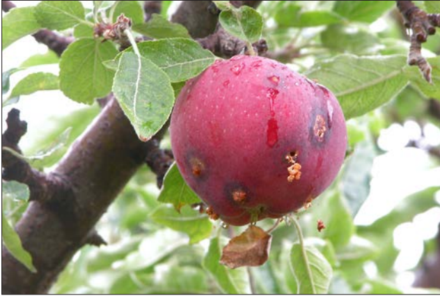
Figure 2. Exit holes and granular frass are the damage symptoms associated with codling moth larvae feeding within an apple.

plant species, be sure to consider an abiotic plant problem first. Note that more than 70 percent of the plant problems examined by university diagnosticians, or trained Master Gardeners, fall under the non-living, or abiotic designation.