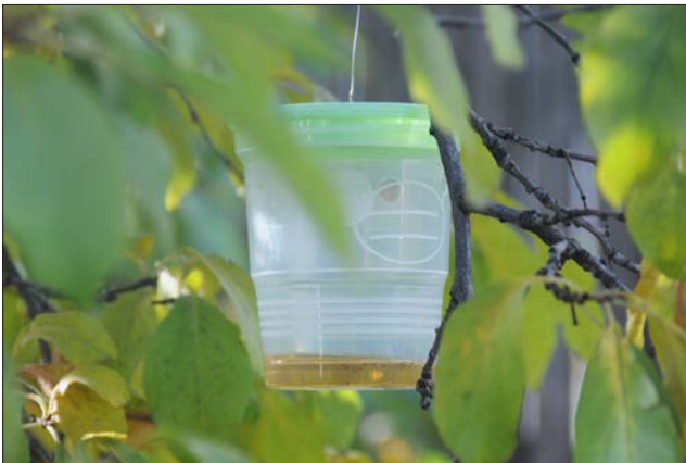
Figure 46. A vinegar fly trap is used for detecting and capturing spotted wing drosophila.

Gardeners can monitor for SWD by using apple cider vinegar traps (Figure 46). To make a trap, take a pint-sized plastic container (such as a yogurt container), and drill ten 3/16 in. holes near the lip. Pour 1 to 2 in. of vinegar into the container and hang it in the center branches of the fruit tree. At the first detection of male SWD flies, consider applying an insecticide.