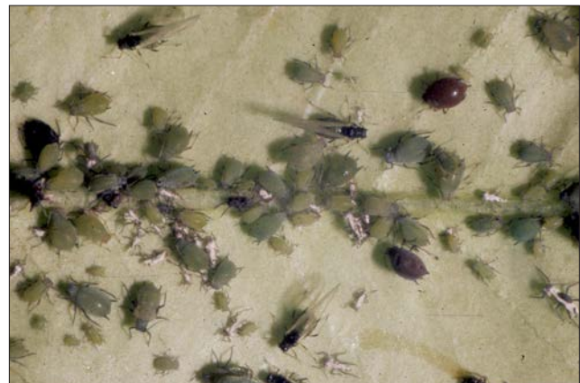
Figure 13. Apple aphids ( Aphis pomi) on the underside of a leaf.

Biological management. There are many beneficial insects that graze on aphids, and in most years,