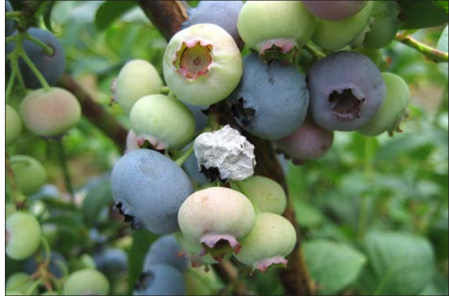
Figure 53. Another symptom of mummyberry infection in blueberries is shriveled fruit.