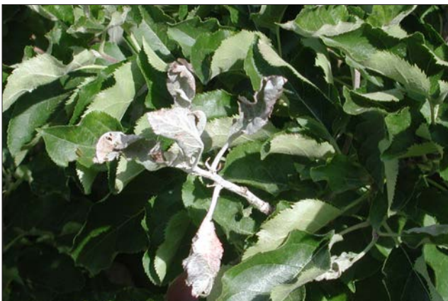
Figure 34. Powdery mildew ( Podosphaera leucotricha ) on apple shoots.

Pest status. Powdery mildew occurs wherever tree fruit are grown; however, it is a serious foliar disease in the drier climates of eastern Washington. Unlike