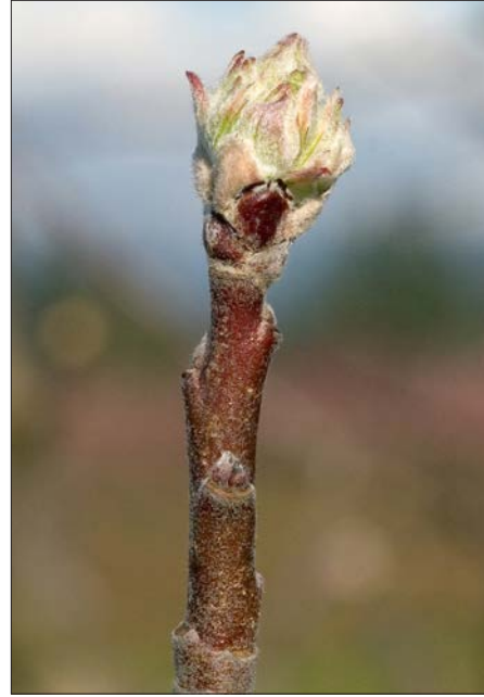
Figure 40. This apple spur is classified as "1/2 inch green tip"—the proper time to apply fixed copper for scab management.