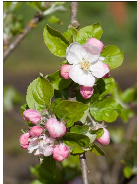
Figure 41. A Winesap apple tree in full bloom. Full bloom is the best time to apply wettable sulfur for apple scab management.

Organic pesticides. Home gardeners can treat their susceptible cultivars with organic fungicides. During wet spring weather, 2 to 3 applications of a suitable fungicide will be required to protect against late season scab development. Fixed copper is best applied in April when buds show at 1/2 in. green tip (Figure 40). It should be reapplied when the leaf buds have swollen and begun to open, and finally, when 1/2 in. of green leaf tissue is visible. Copper octanoate can be used during bloom (Figure 41) through petal fall, but not afterwards, use later in the season can cause