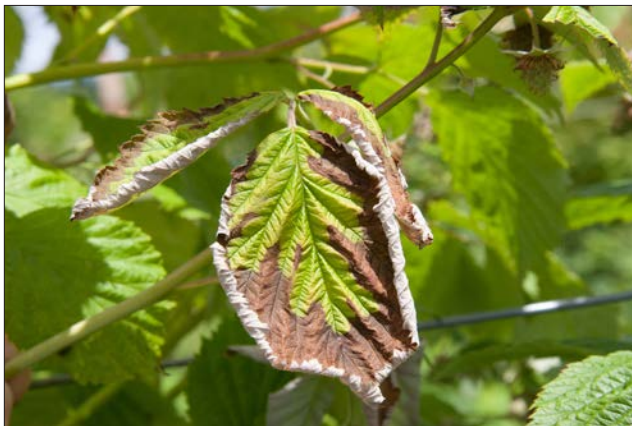
Figure 55. Signs of root rot ( Phytophthora spp.) on red raspberries.

Cultural management. Root rot is common on plants grown in soil that drains poorly during the