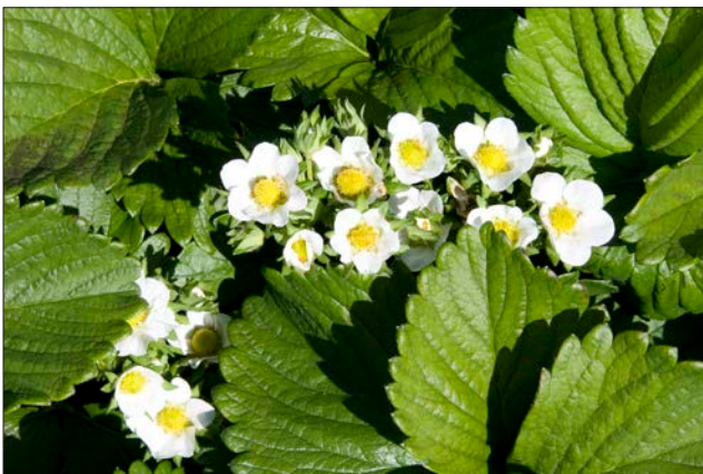
Figure 3. A healthy stand of June bearing strawberry flowers that have not been subjected to April frost damage should yield an abundant crop.

Abiotic plant problems may be caused by physical, chemical, or environmental factors. Physical factors may include air and water barriers such as compacted soil, pavement, or weed barrier fabric that inhibit normal plant growth. Physical damage can also occur from human activities, such as mowing or using string trimmers too close to the trunk of fruit trees or canes. Chemical factors may include herbicide drift, excessive salinity, or soil contamination with materials toxic to plants. Abiotic disorders can be caused by exposing a plant to environmental factors such as high summer temperatures or extremely low winter temperatures. Spring frost injury is best avoided by selecting the right micro-climate within the home landscape (Figure 3). Fruit planted in the lowest ly-