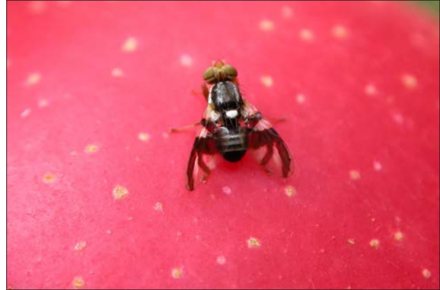
Figure 19. An adult fly of the apple maggot.

for the presence of clear wings with black bands, a pronounced white spot on the back of the thorax, and a black abdomen with light cross-bands (Figure 19). In late June and July, adult flies emerge from the ground beneath the host trees and may migrate to nearby home fruit trees, feral trees or commercial orchards. These flies continue to emerge well into the summer and early fall. The highest period of fly activity usually peaks in August. Within 7 to 10 days after emergence, female flies begin to lay elliptical-shaped eggs (1/16 in.) under the skin of fruit by puncturing the surface of the fruit with their ovipositors. Larvae are cream colored, legless maggots that will grow to no more than 3/8 in. in length. When mature, the apple maggot will drop from the fruit to the ground, burrow into the soil, and