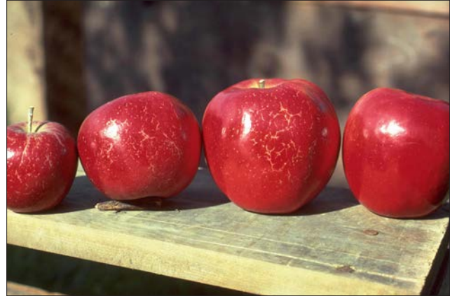
Figure 35. The apples on the left show marks of russetting, a symptom of powdery mildew. The fruit on the right displays the normal, healthy appearance for this variety of apple.