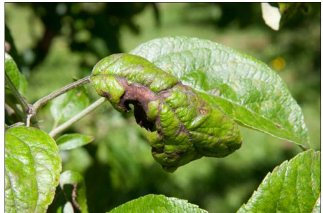
Figure 38. Apple scab lesions on the leaves of an apple tree in June.

Biology and life cycle. Scab is favored by cool, wet weather in the spring when temperatures are between 55°F and 75°F. The disease cycle starts with infested leaves from the previous season that remain underneath the tree’s canopy. Fruiting bodies (apothecia) in the overwintering leaves release fungal spores, known as ascospores, which are carried by wind and rain, and infect developing flowers, leaves, and fruits (Giraud et al. 2011). Susceptible cultivars first show the symptoms of this fungal disease in June when the leaves become twisted and puckered (Figure 38). They will often show water soaked lesions on the underside of the leaves. With severe infection, the leaves can yellow and drop leaving the tree nearly defoliated. Fruit infection can start in July and lead to the formation of corky brown lesions by harvest (Figure 39). On some cultivars scab infections begin later in the summer, resulting in black pin prick spots that can form even after the fruit has been picked and placed into cold storage.