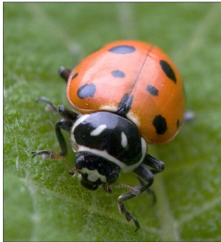
Figure 14. The convergent lady beetle ( Hippodamia convergens ) adult is a voracious consumer of aphids.

these natural enemies do a fair job of keeping aphid populations in check. Beneficial insects include lady beetles (Figures 14 and 15), lacewings, syrphid flies, and parasitic wasps that sting and lay eggs in aphids. Learn to recognize these beneficial insects and conserve them. Many types of beneficial insects can be drawn to the home landscape by planting certain flowers in the yard, such as asters and legumes, as ground cover beneath the fruit tree. Perhaps one of the best ways to conserve these biological agents is to minimize pesticide use. Organic pesticides products should only be used when necessary to protect the fruit and maintain the health of your tree.