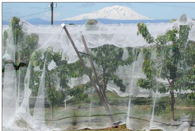
Figure 6. Bird netting protects fruit from bird feeding damage. These sweet cherry trees are only 12 feet tall.

Physical management practices include “roguing out” (removing) plants with weak growth, or covering desirable plants with a physical barrier to protect them from pests such as insects, birds (Figure 6), or vertebrates. Chemical management involves the use of pesticides—in this manual, that means the use of organically approved pesticides (See Organic Pesticides below). Biological management involves con-