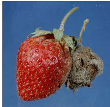
Figure 50. Gray mold ( Botrytis cinerea ) on strawberries.

developing flowers and green fruit. Infected plant parts become covered with gray fuzzy masses of spores followed by a soft rot (Figure 50), making the fruit unsuitable for consumption. Strawberries are prone to gray mold infection as they mature in late May through early June when the weather is still unsettled. Red raspberries may be less susceptible since they ripen in mid-June when the weather is typically improved. Trailing blackberries ripen in mid-July when the weather is dry, and generally escape infection.