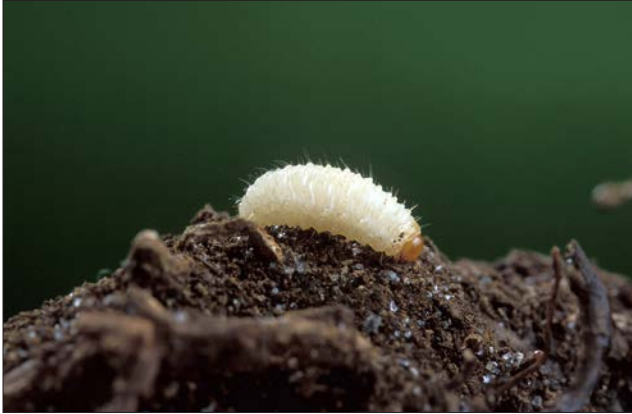
Figure 57. Black vine root weevil larvae ( Otiohynchus spp.).