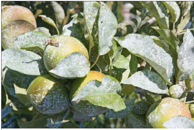
Figure 21. These apples have been sprayed with kaolin clay to protect them from insect pests.

Organic pesticides. Begin applying insecticides approximately 17 to 21 days after full bloom. Spinosad products may be considered, though they do not seem to offer sufficient protection in trials where apple maggot infestation is high. The least toxic pesticide alternative product for apple maggot is kaolin clay . Start applications in late June and continue through the summer months to keep the fruit covered with the clay residue (Figure 21). Applications of clay will be required once every two weeks as rapidly expanding apples can create breaks in the clay residue. In the event of a significant rain, a reapplication of kaolin clay may be necessary.