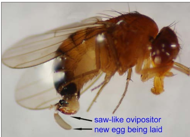
Figure 43. The female spotted wing drosophila lacks spotted wings.

Like common vinegar flies found in the home kitchen, SWD flies are attracted to overripe fruit, but they will also attack and lay eggs in ripe fruit. Eggs can be identified by the two hair-like filaments that protrude from the fruit (the egg is within the fruit), and scarring or spotting on the fruit surface. The larvae are very small (1/16 to 1/8 in.) and white in color (Figure 44). The presence of larvae within the fruit can be noted with a hand microscope (10-fold magnification). The larvae will feed inside the fruit for 5 to 7 days. When mature, the small white larvae can be seen with the naked eye when the fruit is squeezed open. If infested fruit is left on the tree, the larvae will pupate (the non-feeding stage) in the fruit. The pupae are darker in color than the larvae and can easily be seen near the surface of the fruit (Figure 45).