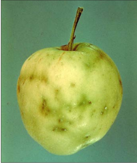
Figure 17. The dimples and discoloration on the outside of the apple are symptoms that the apple maggot ( Rhagoletis pomonella ) feeds within.