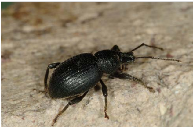
Figure 58. An adult black vine root weevil beetle.

at night, leaving notched leaf edges; it is rare to see adult beetles feeding during the day.