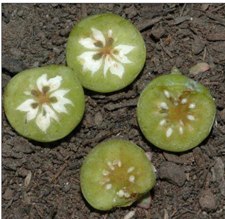
Figure 52. Blueberry fruit infected with mummyberry. Note the white fungal growth inside the fruit.