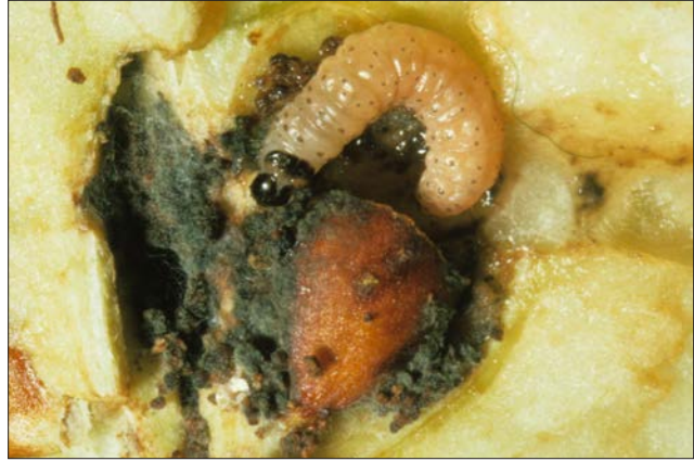
Figure 25. Codling moth larvae often migrate to the apple's core to feed.

Pest symptoms and damage. The larva (or caterpillar) of the codling moth can be up to 5/8 in. long, and feeds in the fruit often near the core (Figures 25 and 26). While the surface of the fruit