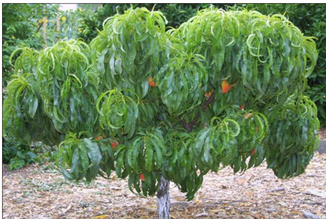
Figure 12. Genetic dwarf peach trees are freestanding and only grow to 6 ft in height at maturity.

For nearly every plant in the home landscape, there is an aphid species that feeds on it. Fruit trees are no exception. Apples host a green apple aphid, cherries