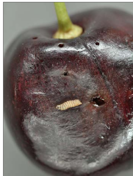
Figure 45. Spotted wing drosophila pupae moving on the outside of a ripe cherry fruit.