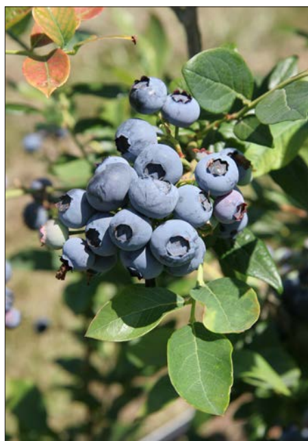
Figure 5. Blueberries can be raised in the home garden when they are planted in soil with a low pH, and in a sunny location with good air circulation.

Integrated Pest Management (IPM) is a holistic approach combining cultural, physical, chemical, and biological management strategies to keep plants healthy and productive (Figure 5). This approach emphasizes management, as opposed to control or eradication. In natural systems, it is rare to achieve total pest eradication. In an IPM approach, pest problems are minimized by keeping pest populations and damage below an economic threshold. IPM seeks to keep gardens looking aesthetically pleasing while preserving plant health, but not necessarily eradicating a pest.