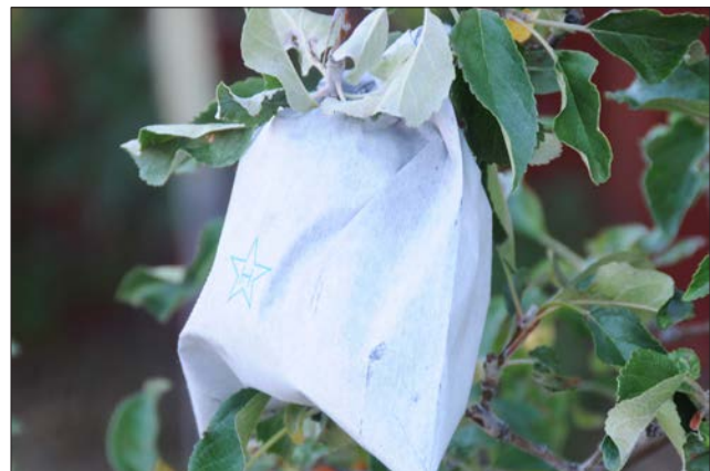
Figure 20. Homeowners can bag individual apples on backyard trees to provide a physical barrier against apple maggot and codling moth.

Physical management. Homeowners with small trees can bag individual fruit with paper lunch bags, paper fruit bags (Figure 20), or nylon bags, known as