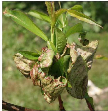
Figure 32. Peach leaf curl ( Taphrina deformans ).

Biology and life cycle. Initial disease infection early in the spring results in leaf defoliation and the subsequent new growth will also show the leaf symptoms (Figure 32). Heavily infected trees often die. The fungus overwinters as conidial spores beneath the tree and are spread by wind and rain, infecting the emerging buds as they start to swell in February.