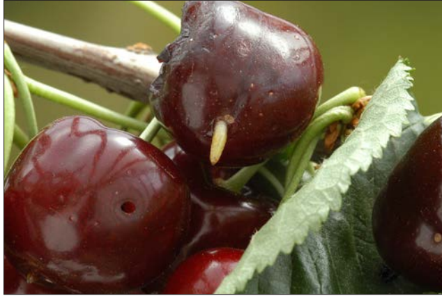
Figure 49. An adult cherry fruit maggot emerges from the fruit.

Cultural management. Shortly after cherry harvest, remove as much of the fruit from the cherry tree as possible. Unpicked cherries can serve as homes for the next season's lifecycle of cherry fruit flies. If your tree is not on dwarfing rootstock, this management tactic is difficult to achieve. Gisela rootstocks are the most popular dwarfing rootstocks for the home garden. With annual pruning, it is possible to keep the dwarfing cherry tree 10 to 12 feet in height.