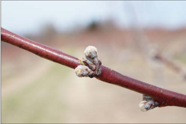
Figure 33. Peach bud swell.