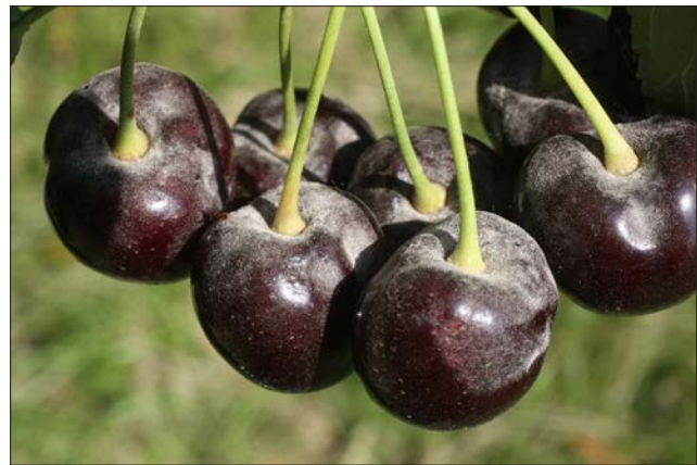
Figure 36. Signs of powdery mildew on cherries.

other diseases, powdery mildew is favored by humid nights and warm days.