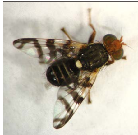
Figure 47. Adult Western cherry fruit fly ( Rhagoletis indifferens ) is about 1/5 inch long, with a unique pattern of bars on its wings.

The adult female fly (Figure 47) begins laying eggs as early as late May and continues until mid-August. The female fly punctures the fruit's surface and the eggs are laid individually, just under the skin of the fruit. The eggs hatch into tiny maggots (Figure 48), and complete their development within a couple weeks while feeding on the inside of the cherry. When the maggot matures, it exits the fruit (Figure 49) and drops to the ground where it will burrow into the soil to pupate.