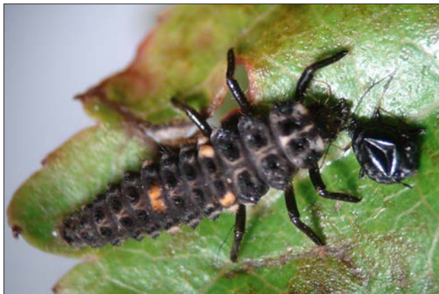
Figure 15. Lady beetle larva consuming a black cherry aphid.

Organic Pesticides. As fruit trees end their winter dormancy (around late March), homeowners can apply horticultural oils to each fruit tree to manage aphids. Look for the silver-tip stage in bud development (Figure 16) on apples and pears. This delayed dormancy application is considered one of the best spray applications to manage aphid species, as well as spider mites and scale insects that are occasionally pest problems in fruit trees. In general, horticultural