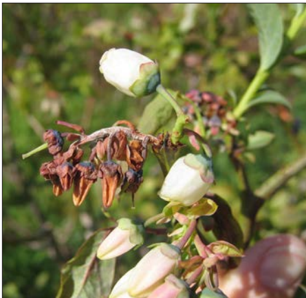
Figure 51. Symptoms of mummyberry ( Monilinia vaccinii-corymbosi ) at the shoot-blight phase.

Infected fruit that drop to the ground will overwinter and develop small mushroom-like spore cups (Figure 54) the following March. Examine the soil