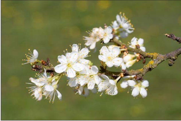
Figure 24. Stone fruit trees need full sun and good air circulation in order to grow well in western Washington.

Citation rootstock which can result in a tree that only grows 8 to 14 feet.