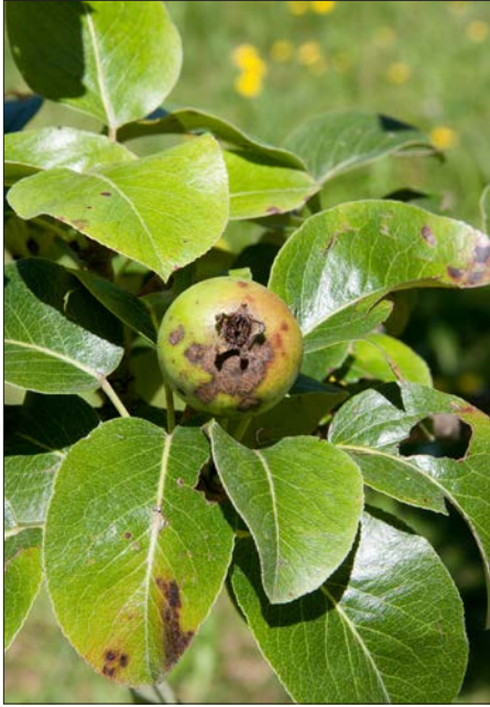
Figure 39. Pear scab ( Venturia pirina ).