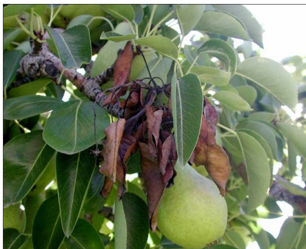
Figure 31. A pear shoot infected with fire blight ( Erwinia amylovora ). Note the blackened leaves and flower cluster that failed to drop from the tree.

Fire blight is a bacterial disease that can devastate young, vigorous apple and pear trees. Initially, branches, twigs, or spurs infected with fire blight will display leaves, flower clusters, and young fruit that appear to turn black (pear trees; Figure 31) or brown (apple trees). These dead leaves (shoot tip blights)