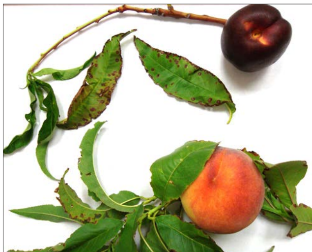
Figure 30. Symptoms of Coryneum blight on plum and peach.

Biology and life cycle. This disease overwinters in infected buds and twig lesions. Fungal spores are produced in response to prolonged periods of wet weather during the winter and spring, and dispersed from tree to tree by splashing, blowing rain. Dry weather will stop the spread of the disease, but the fungus survives inside infected buds and twig lesions until rainy conditions return in the autumn.