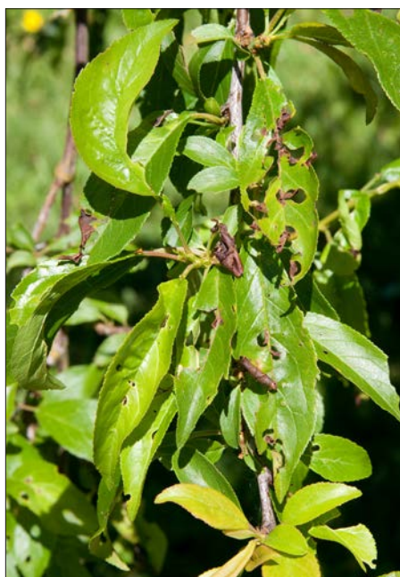
Figure 29. The symptoms of Coryneum blight ( Wilsonomyces carpophilus ) appear as shot-holes on the leaves of a plum tree.

Pest status. Coryneum blight is a widespread fungal disease of peaches, nectarines, and apricots; and cherries or plums that are grown close to infected soft-fruit trees.