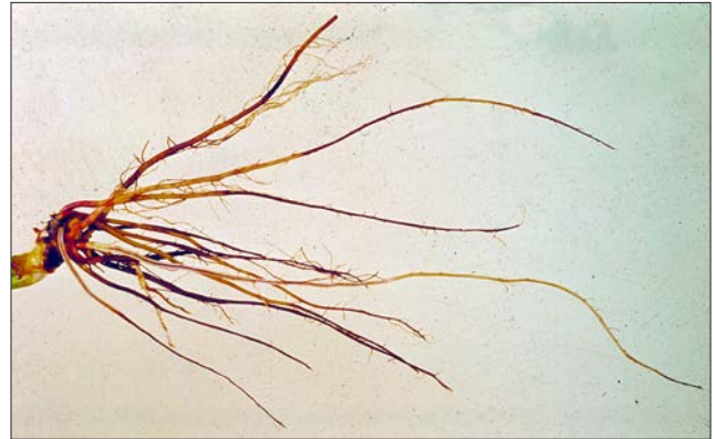
Figure 56. Red stele root rot on strawberry roots.

winter months. Home gardeners can successfully overcome wet soil conditions by utilizing raised beds that are at least 12 in. higher than the surrounding soil. If root rot has occurred in the garden in the past, it is advisable to fill the raised beds with new soil and work the new soil into the existing soil. Slope the soil away from the raised beds in order to avoid any chance of flooding.