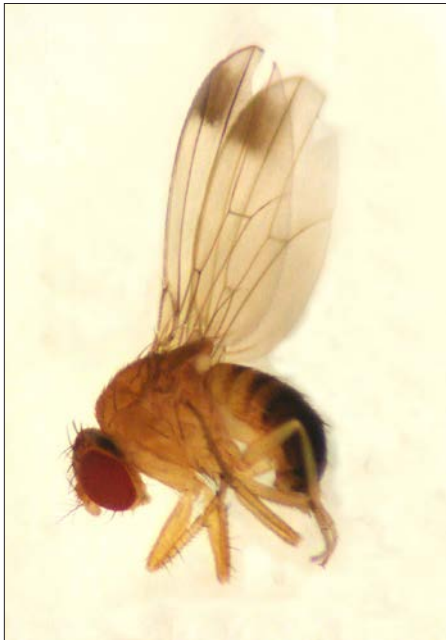
Figure 42. The 1/8-inch long spotted wing drosophila ( Drosophila suzukii ) male fly can be identified by the two dark spots on its wings.

Biology and life cycle. Adult flies resemble other common vinegar flies, but the male SWD have two prominent black spots near the leading edge of their wings (Figure 42). Females lack the spotted wing, but have a large, saw-like ovipositor on the tip of the abdomen that is used to deposit eggs in fruit (Thistlewood 2012) (Figure 43). In western Washington, females will start to lay eggs in maturing fruit in early June; and there may be 3 to 9 generations per year.