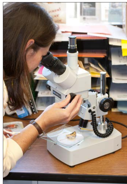
Figure 4. Do not hesitate to consult with Extension faculty or a Master Gardener volunteer to correctly identify pest problems.

Pest identification is easier when you capture the pest in the process of damaging the plant, but often it is your observations of the symptoms of pest damage that makes diagnosis possible. Make sure to collect and compare the damaged plant material with undamaged plant samples. It is best to use diagnostic resources pertinent to the region in the state where you reside. If possible, check more than one reference manual. Proper pest identification may be confirmed through consultation with university extension faculty (Figure 4) or a trained Master Gardener volunteer.