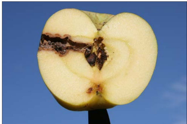
Figure 26. Codling moth ( Cydia pomonella ) damage is often compartmentalized within the fruit, making it somewhat salvageable.

may appear normal, the core of the fruit will become blackened and decayed. Undamaged portions of the fruit could be used for juice or cider.