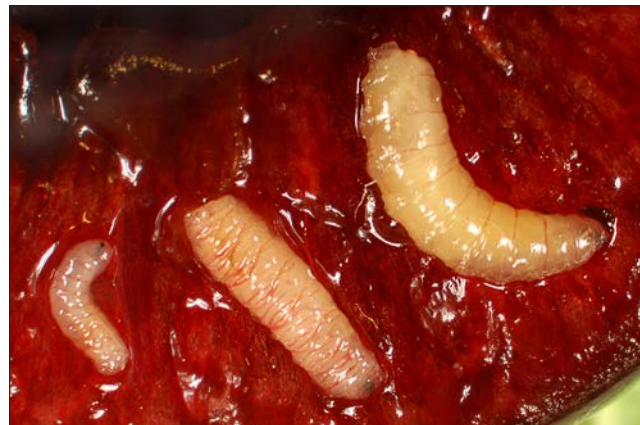
Figure 48. Western cherry fruit fly maggots inside a cherry fruit.