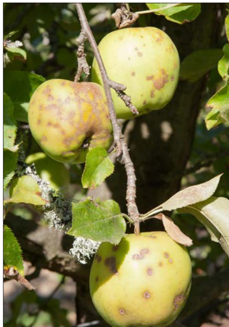
Figure 37. Apple scab ( Venturia inaequalis ) lesions on the fruit and leaves of an apple tree.

Scab is considered the most destructive fungal disease to apples and pears—wherever they are grown. The surface of the affected fruit can be heavily blemished with scab lesions (Figure 37) and in severe cases, the fruit surface can split open.