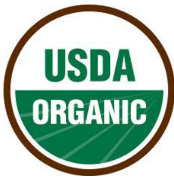
Figure 7. United States Department of Agriculture National Organic Program label.

2000 by the United States Department of Agriculture (USDA) Agricultural Marketing Service. The Environmental Protection Agency (EPA) set guidelines on the definition of organic pesticides, thus meeting the requirement of the NOP rule. Essentially, most synthetic pesticides are prohibited by the NOP rule, while all products with active ingredients derived from a natural source are allowed. When a pesticide meets the NOP rule, it is considered organic and will have the NOP logo on its pesticide label (Figure 7).